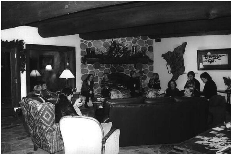
WLU members relaxing during recent retreat held November 11-12 at Daniels Summit Lodge